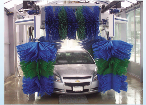
Powerful five-brush system cleans everything it touches, delivering up to 20 clean cars every hour