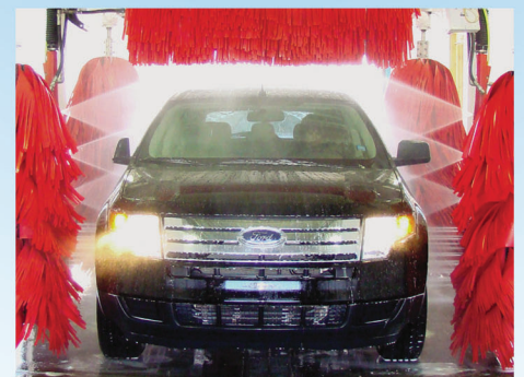
Available HydroBlade® with Wheel Stinger® adds high pressure and wheel cleaning upsell opportunities