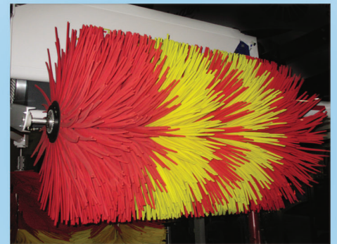
Available Whisper Wheel® top wheel fill runs quietly, increasing customer perception of a gentle wash process